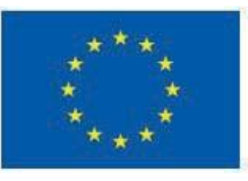
Co-funded by the COSME programme of the European Union